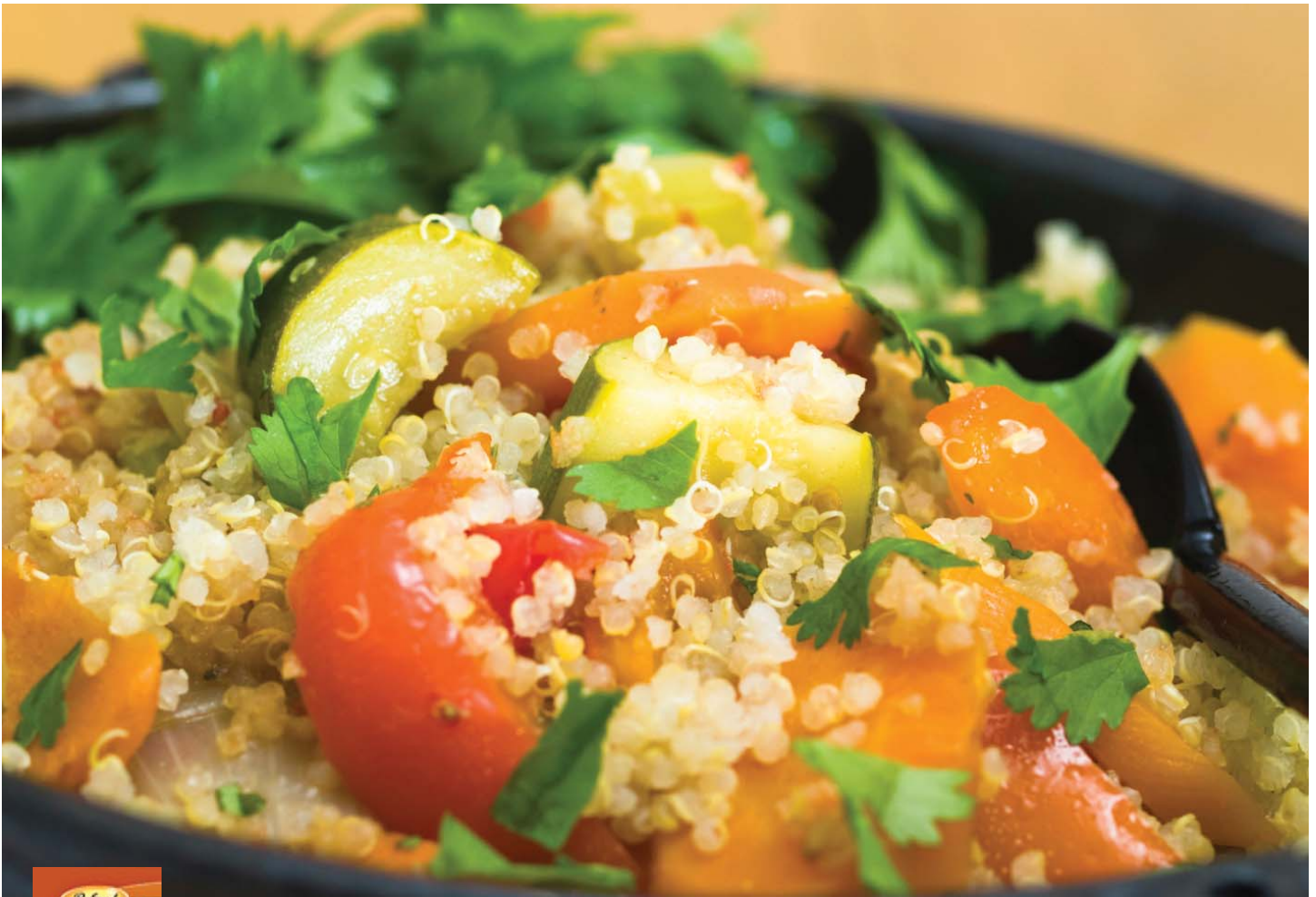
Vegetarian Quinoa Stew served with carrots, onions, red pepper, celery, zucchini and coriander leaf.