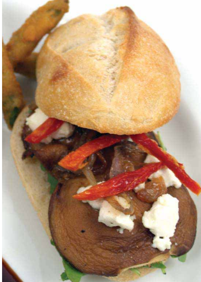
Shiitake Mushroom - Shiitake Mushroom Slider with goat cheese, sundried tomatoes & caramelized shallots served with fried asparagus