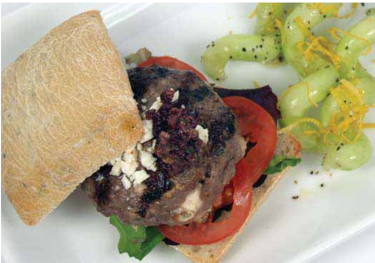
Mediterranean Lamb - Lamb Burger Slider with feta & tapenade served with cucumber salad