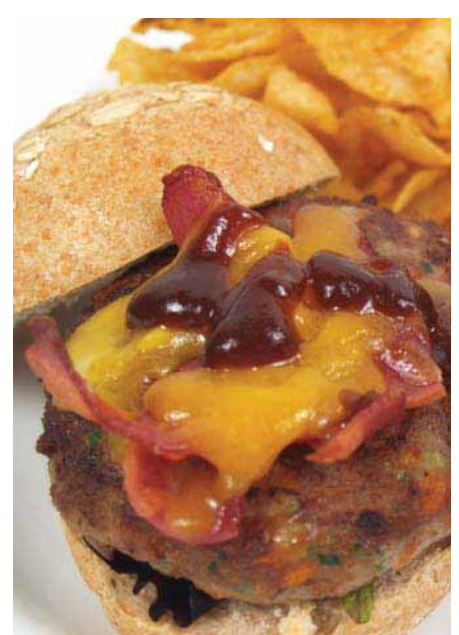
Tommy's Turkey - Turkey Burger Slider with bacon, cheddar cheese & BBQ sauce served with BBQ chips