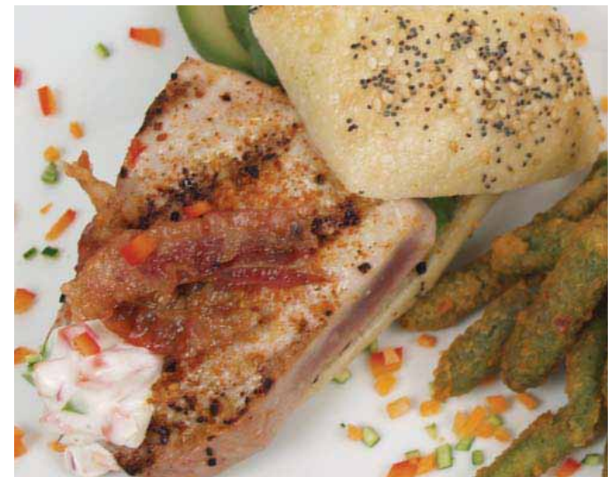
Tuna Bacon Avocado - Tuna Steak Slider with bacon, avocado & salsa mayo served with fried green beans