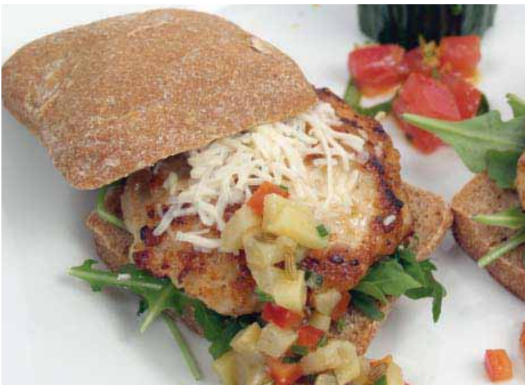
Artichoke Chicken - Chicken Burger Slider with Asiago cheese & artichoke bruschetta served with tomato salad