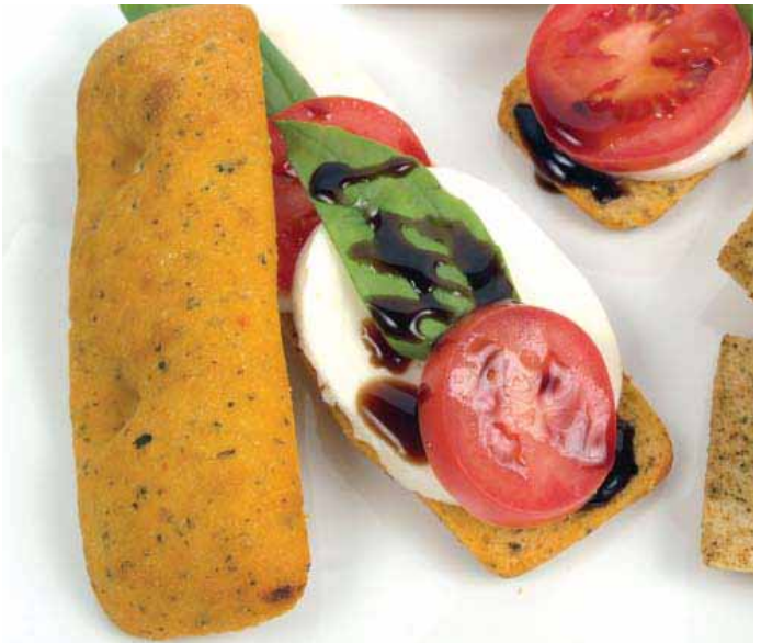
Caprese - Fresh Mozzarella Caprese Slider with fresh basil served with pesto sundried tomato chips