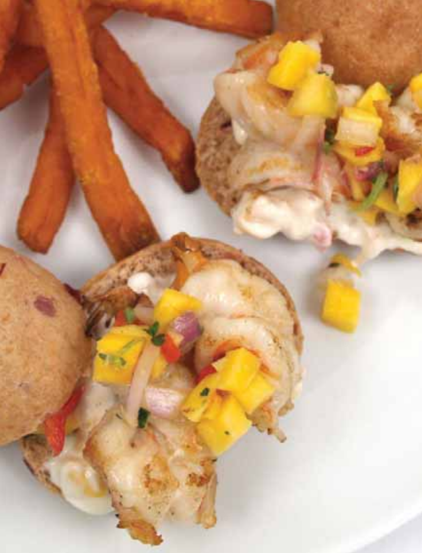
Mango Mango Shrimp - Shrimp Slider with mango aioli & mango salsa served with sweet potato fries