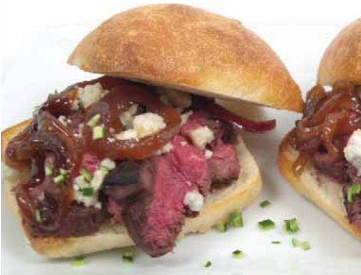
Fabulous Flat Iron - CAB All Natural Flat Iron Steak Slider with blue cheese crumbles & red onion marmalade served with julienne fries