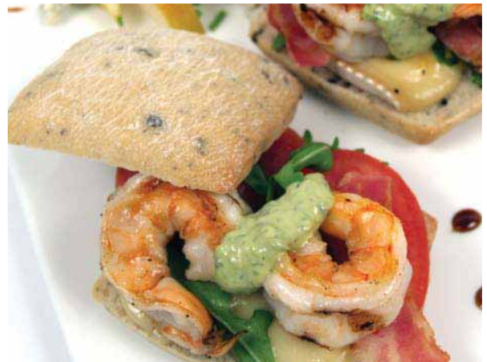
Shrimp Clubhouse - Shrimp Slider with bacon, brie, & pesto mayo served with tomato salad