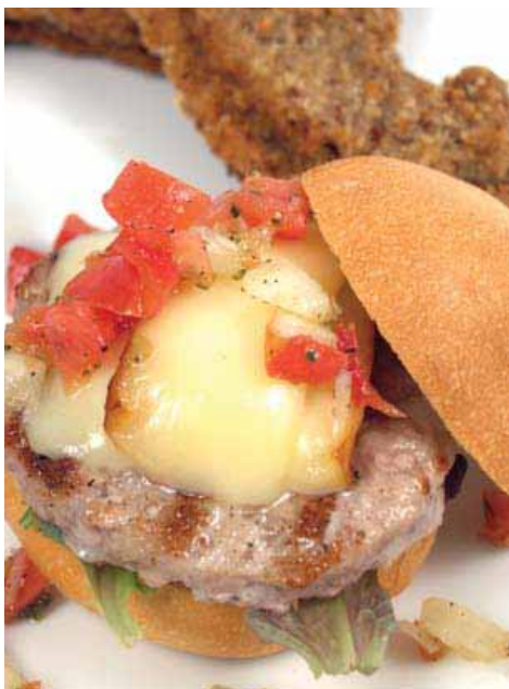
My Cousin Vinnie's Veal - Veal Slider with smoked mozzarella, fresh bruschetta served with fried portobello mushrooms