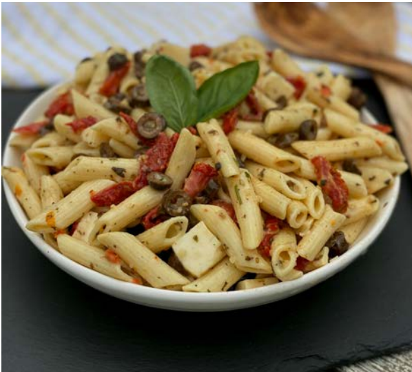
Penne Pasta Salad with Provolone and Sun Dried Tomatoes Item #623876

Penne pasta mixed with a light oil and vinegar dressing topped with black olives, provolone chunks and julienned sun dried tomatoes.