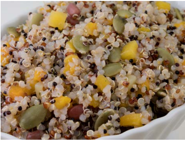
Mango Lime Quinoa Salad Item #559412

A blend of quinoa and adzuki beans with diced mango and pumpkin seeds in a cilantro lime vinaigrette.