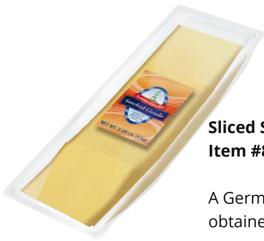
Sliced Smoked Gouda Item #800467

A German smoked cheese with a fine, smoky flavor obtained by smoking over natural beech wood.