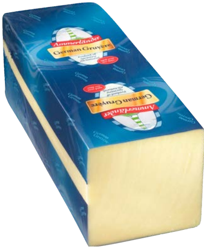
Ammerlander Gruyere Loaf Item #579249

Smooth and creamy Gruyere is rich and verbose in flavor. This peppery, nutty and full-flavored cheese has a semi-hard texture and fabulous melting quality.