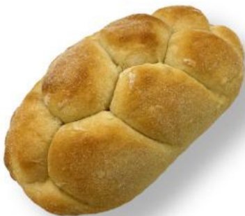
Luau Sandwich Roll Item #694552

Smooth and creamy Gruyere is rich and verbose in flavor. This peppery, nutty and full-flavored cheese has a semi-hard texture and fabulous melting quality.